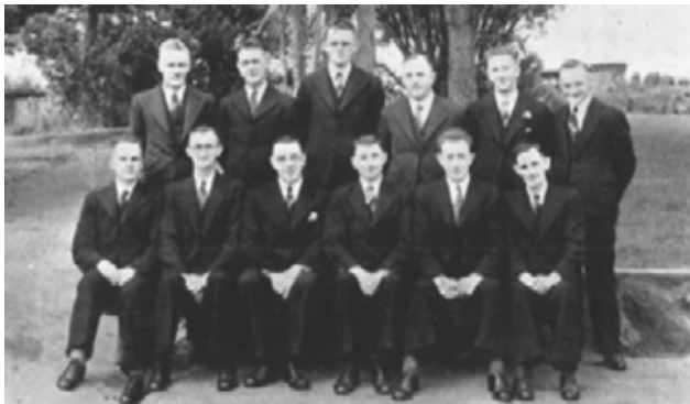
The Reunion Executive