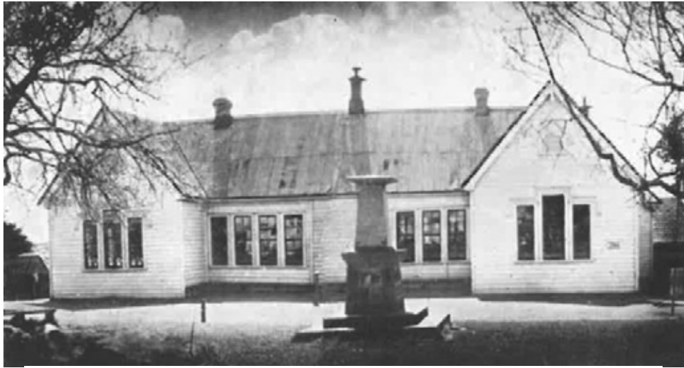
Our Old School: Mount Albert School, opened 10 th January, 1870

In November 1938 Mount Albert School held a reunion, 68 years after it opened in January 1870. The Reunion marked an ending and a beginning. The school had outgrown its site, and by 1940 was relocated to 7½ acres on its present site in Sainsbury Rd.