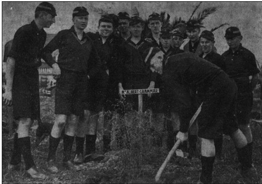
ARBOR DAY CEREMONY AT GRIBBLE-HIRST PARK, MOUNT ALBERT (CIRCA 1939)

Mount Albert Grammar School boys planting one of the trees during yesterday's ceremony in observance of Arbor Day. Members of the Mount Albert Borough Council and pupils from schools within the borough planted about 100 native and exotic trees in Gribble-Hirst Park.