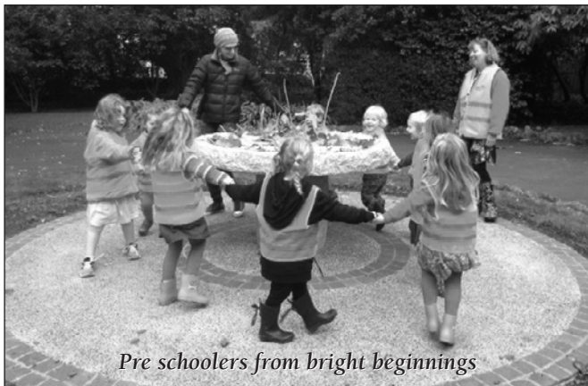
Pre schoolers from bright beginnings