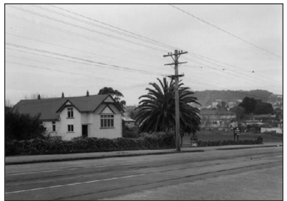
Enlarged Mt Albert Baptist Church showing tram lines and vacant corner section. C 1935