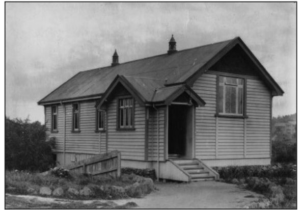
The first Mt Albert Baptist Church 1915 800sq ft