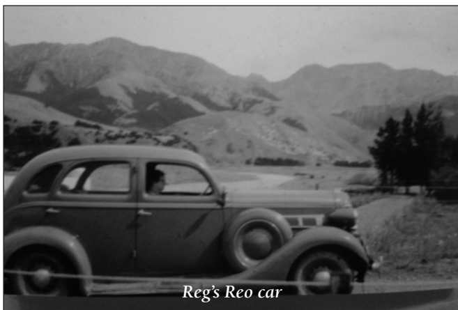
Reg's Reo car