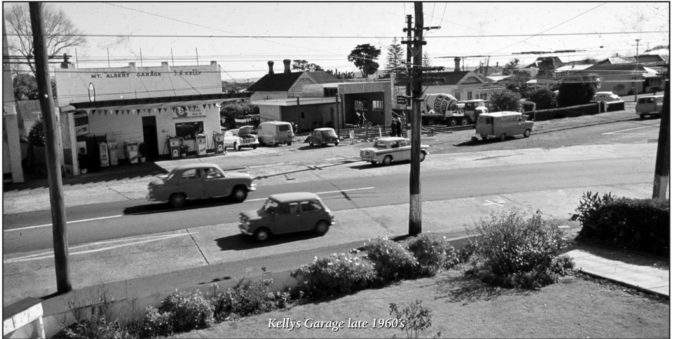
Kellys Garage late 1960's