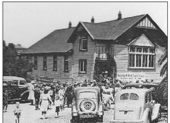
Mt Albert Baptist Church Sunday School Anniversary day 1945