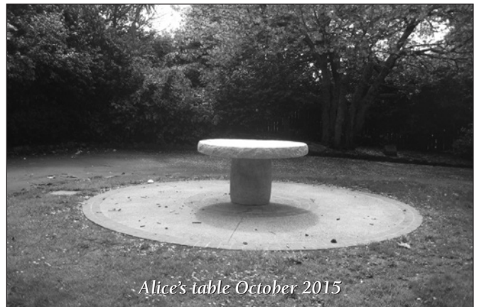
Alice's table October 2015