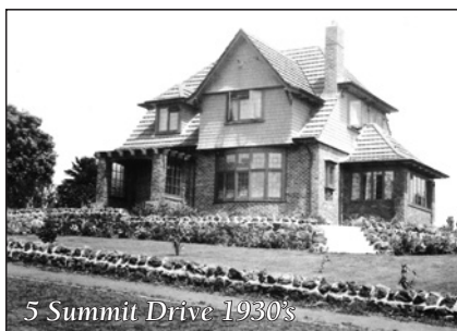
5 Summit Drive 1930's

1929, 5 Summit Drive , built for S Takle. This is one of the few double storied houses Hooper designed in Auckland and is typical of the type of house he was well known for in Dunedin. This photo taken a few years after the house was built shows its original Hooper design details of human scale entry fenestration, bow windows and harmony of balance. More recently it has been extended on the right side.