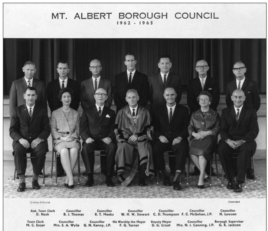
MT. ALBERT BOROUGH COUNCIL 1962 - 1965