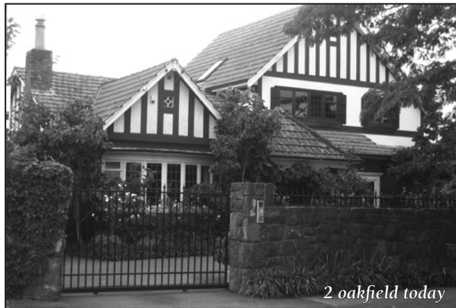
2 oakfield today