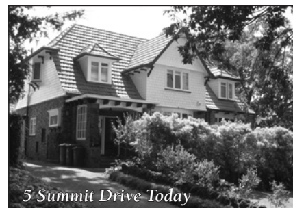
5 Summit Drive Today