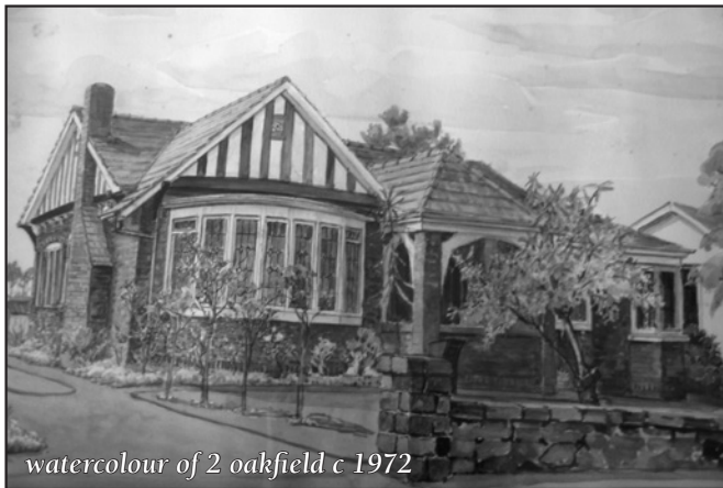
watercolour of 2 oakfield c 1972