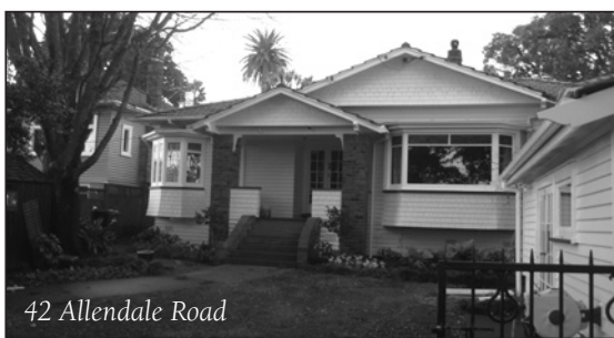
42 Allendale Road