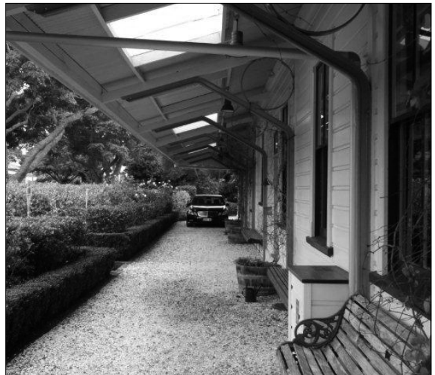
Malvern Road, Mt Albert

Interested in becoming a member of MAHS? email: info@mtalberthistoricalsociety.org.nz