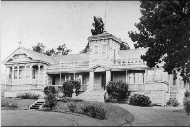
Greystone Knowe, New North Road, Mt Albert, Auckland. c.1895