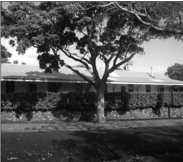
Malvern Road, Mt Albert MAHS collection 2012