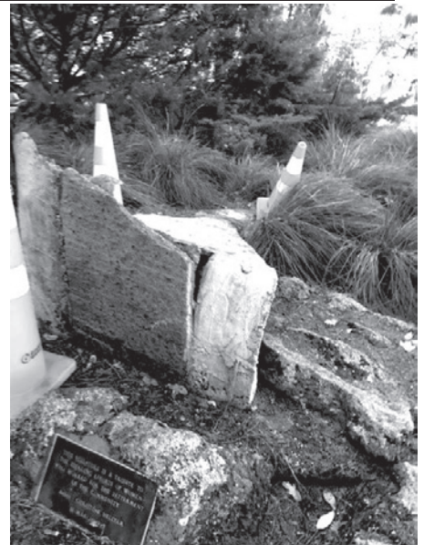
Photo on right of bent-over sculpture and orange cones from: Tina Molyneau (2022, May 5). Five sculptures vandalised across Auckland as thieves target parks. New Zealand Herald. https://www.nzherald.co.nz/nz/five-sculptures-vandalised-across-auckland-as-thieves-target-parks

Photo on left and text from the information board from: Bronwyn Holloway-Smith (2021). Public Art Heritage Aotearoa New Zealand, https://publicart.nz/artworks/christine-hellyar-1995 .