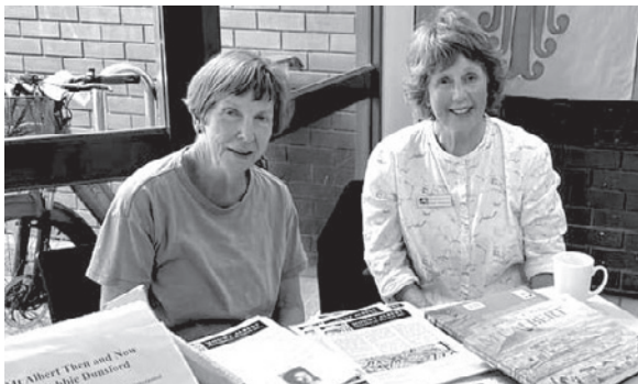
table in Mt Albert Library (left), and on 17 February,